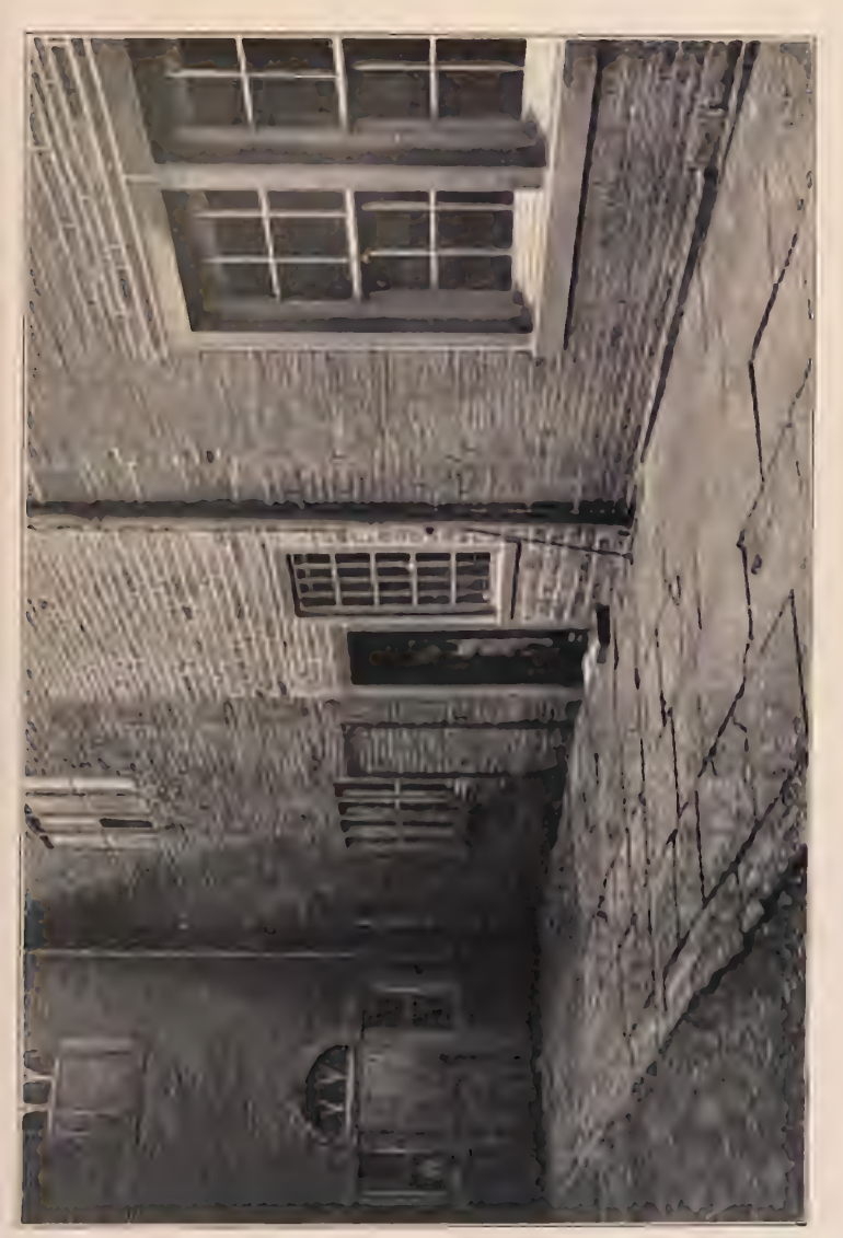
LAW HILL-BACK (WUTHERING HEIGHTS).